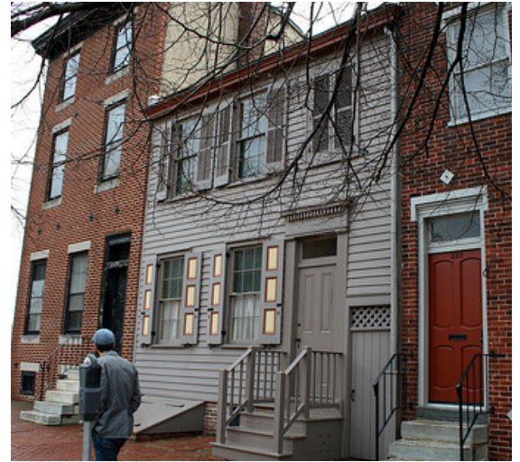
left: Wiggins Park Marina, right: Walt Whitman House

the house is located near the central Camden Waterfront and open for tours Wednesday through Sunday.