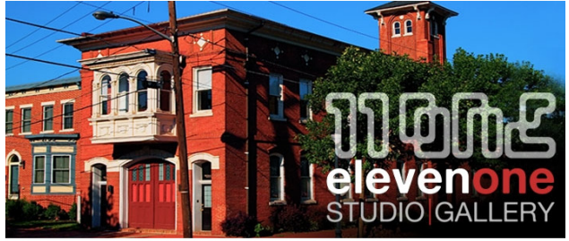
left: view from Battleship New Jersey, top center: visitor at Camden Children's Garden, top right: Petty's Island Rum from Cooper River Distillery, bottom right: Eleven One Studio Gallery