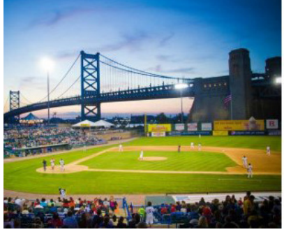
above: Camden Riversharks baseball stadium, left: visitors at the Camden Aquarium.